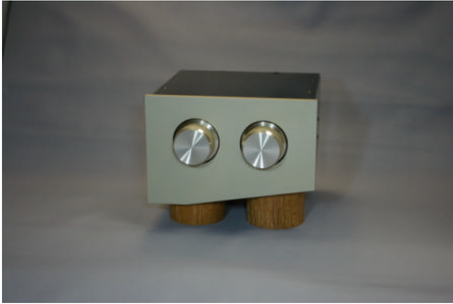
10K Constant Impedance Attenuator : 10K Out (0~60dB/24 position) & 6000 Out