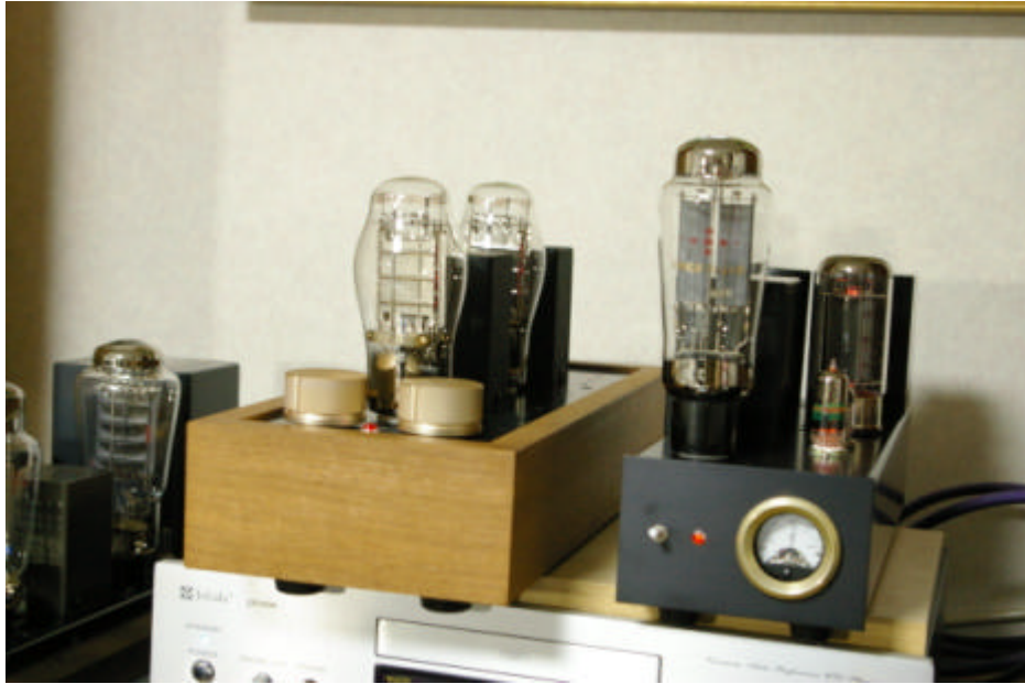
AV8B Single Line Amp With Tube based Voltage regulator 6000 Out AV8B : E_p=186V , I_p=15mA at E_g=18.2V