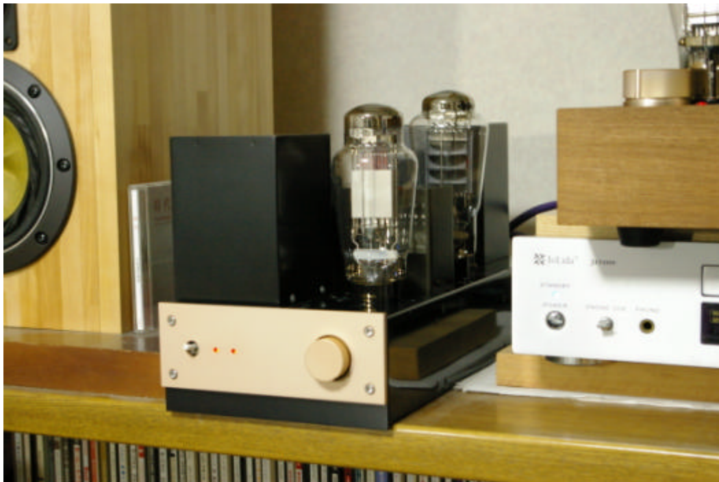
EML30B + Inter stage 1:2 + EML302B

EML30B : E_p = 328V , I_p = 11mA at E_g = 5.6V