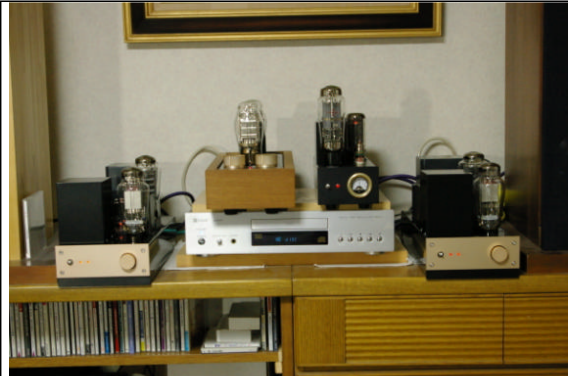
Power Amp: EML30B + EML320B / Line Amp: AV8B with 274B Tube Voltage regulator